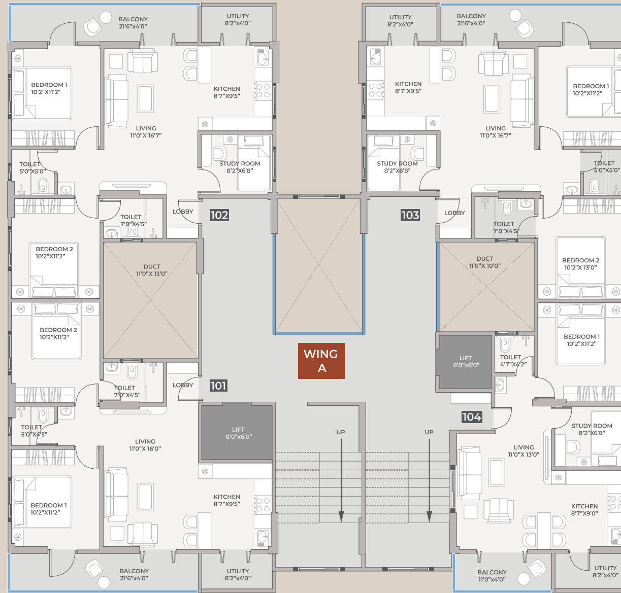
UNIT 1 Builtup Area 1040 sq.ft