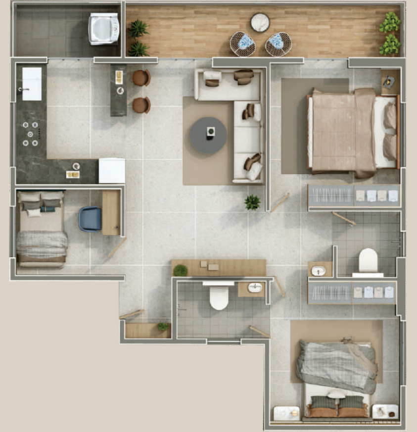
Builtup Area 1144 sq.ft UNIT 3