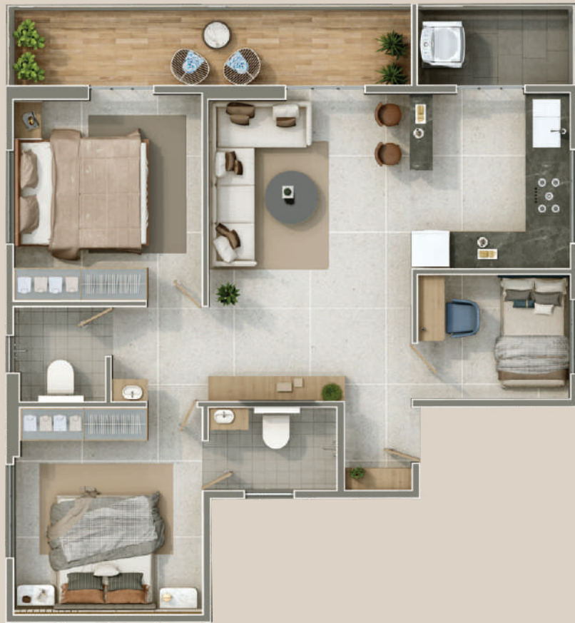
Builtup Area 1144 sq.ft UNIT 2