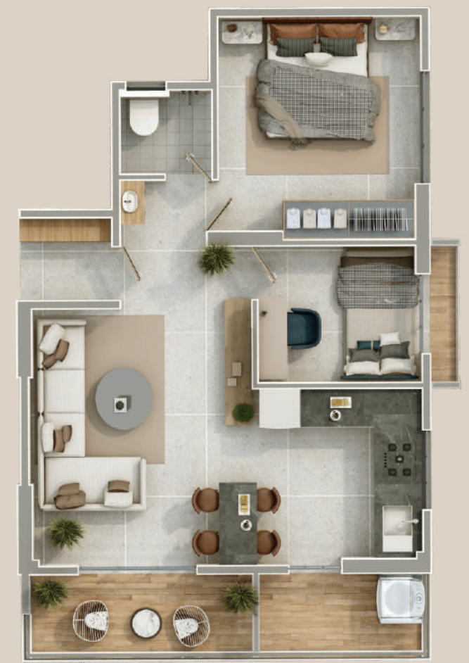
UNIT 4 Builtup Area 775 sq.ft